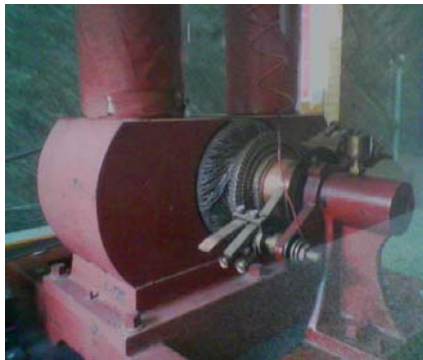
1880 Edison DC Dynamo