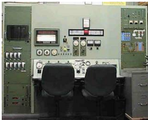
Control Room of Nuclear Reactor

Nuclear Reactor Lab: The UW Nuclear Reactor is a research reactor primarily used for educational purposes (instruct students, train operators and perform scientific studies using the radiation present in the core). It is also used to educate the general public about the operations, equipment, and science of a nuclear reactor. Take a virtual tour at < http://reactor.engr.wisc.edu >.