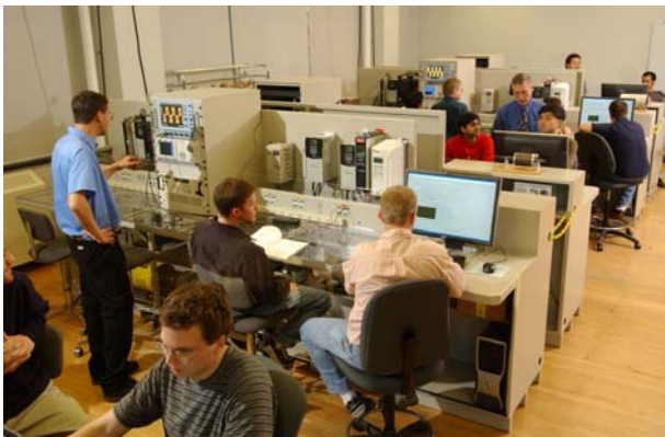
Grainger Teaching Lab

Power Electronics Lab: The enabling nature of power electronics and its impact on factory automation, robotics, transportation, energy efficiency, electric automobiles, residential and commercial appliances, alternate energy and computers as well as other electronic equipment is increasingly providing important utility applications. The Wisconsin Electric Machines and Power Electronics Center (WEMPEC) has offered a power electronics and electric machines research and education program since the early 1980s. Tours will be given of the WEMPEC research and teaching labs. Student posters will be available.