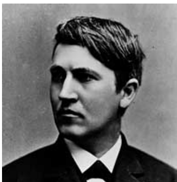
Thomas Alva Edison